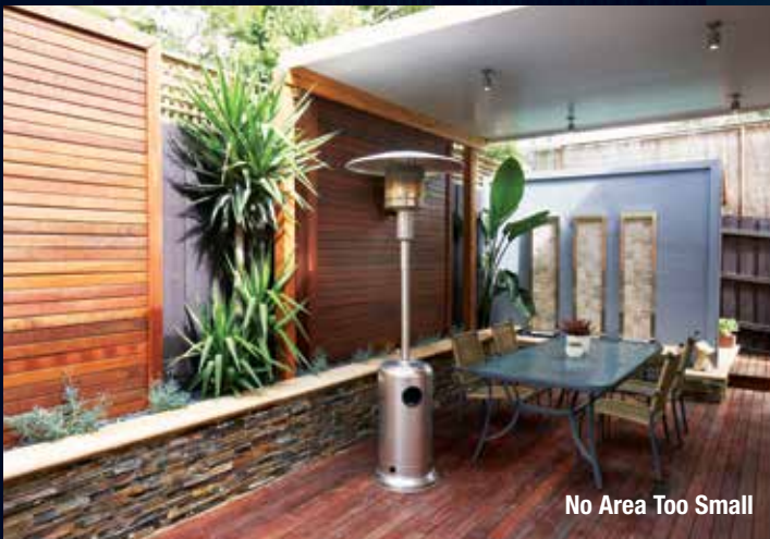
No Area Too Small