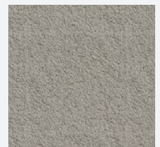
Dulux Acratex – Render Ready